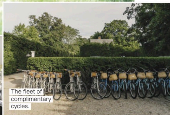
The fleet of complimentary cycles.