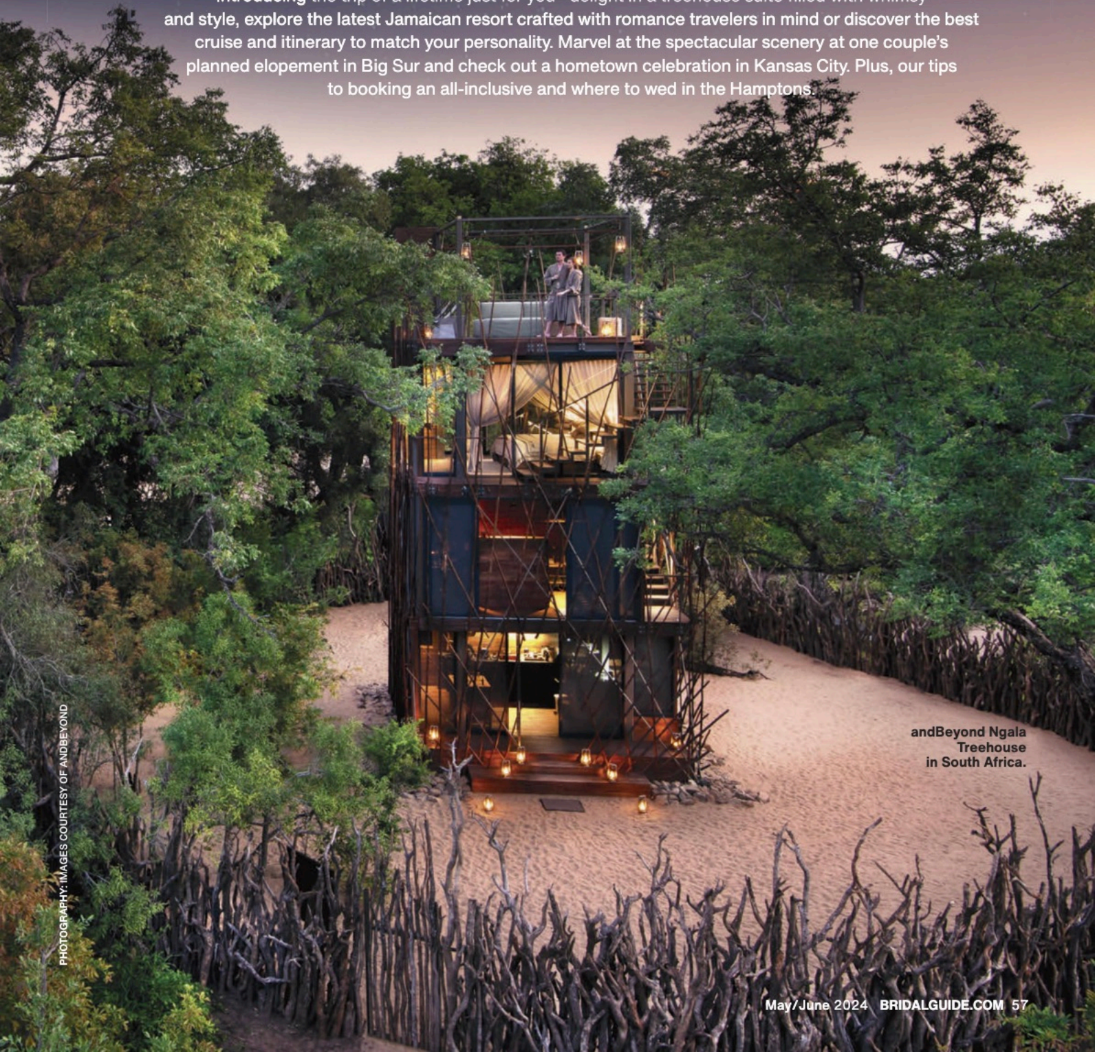
andBeyond Ngala Treehouse in South Africa.

Introducing the trip of a lifetime just for you—delight in a treehouse suite filled with whimsy and style, explore the latest Jamaican resort crafted with romance travelers in mind or discover the best cruise and itinerary to match your personality. Marvel at the spectacular scenery at one couple's planned elopement in Big Sur and check out a hometown celebration in Kansas City. Plus, our tips to booking an all-inclusive and where to wed in the Hamptons.